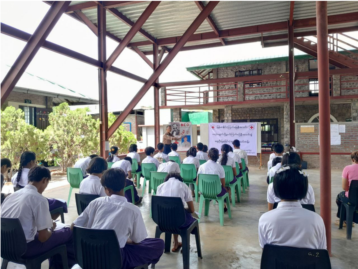
First aid training, in collaboration with the Yenangyaung Township Red Cross Team