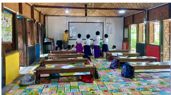
The old kindergarten building received a make-over: the palm-leaf roof was replaced by a zinc roof, steel beams replaced the columns to make the classroom more open, without restricting the view of the blackboard and with more space to play.