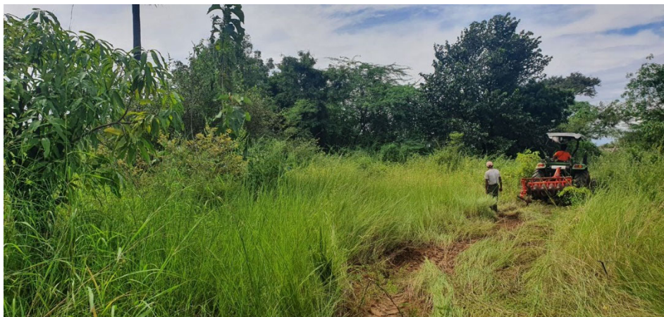
Land before work began...