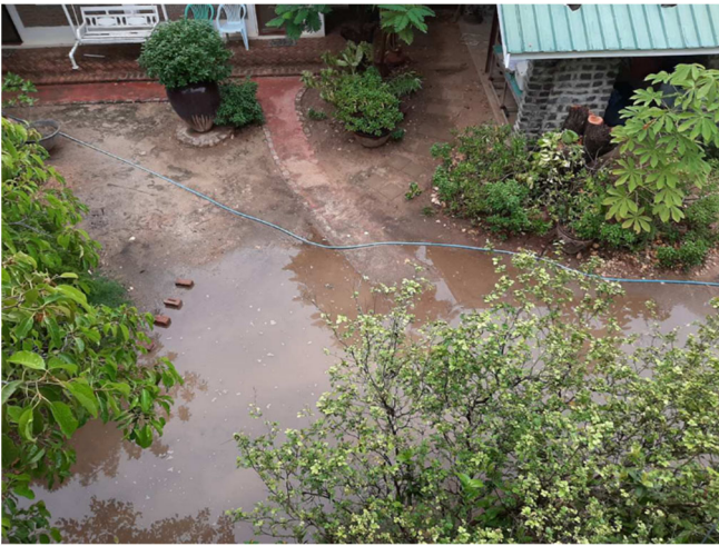
Heavy rains cause flooding at the Guest House

Myanmar has unfortunately again been in the negative headlines worldwide. Natural disasters and flooding took a heavy toll this year, with nearly 100 people killed and 200'000 displaced. Our Magway Division was also badly affected; even now, the flood relief centre remains open.