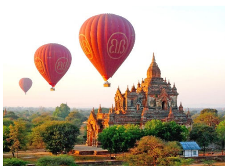
Early morning – hot air balloons over Bagan