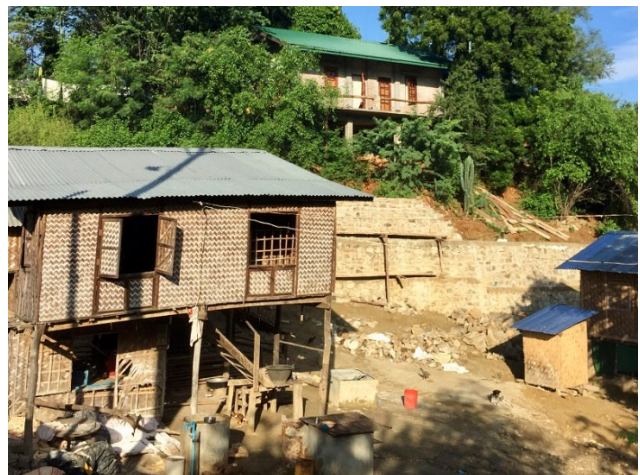
Construction of massive retaining wall at the edge of the Lei Thar Gone Property / November 2016