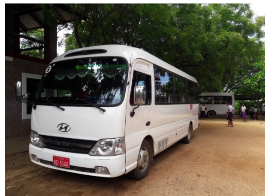
The new school bus